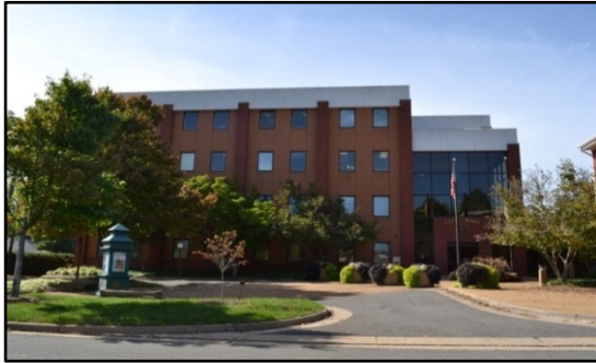
Marvin L. Gillum City Hall

Completed renovations to City Hall plaza. Continued planning to renovate the 1st and 2nd floors of City Hall, reroof the building, and replace the generator, which is over 25 years old and is critical to the computerized systems of the City.