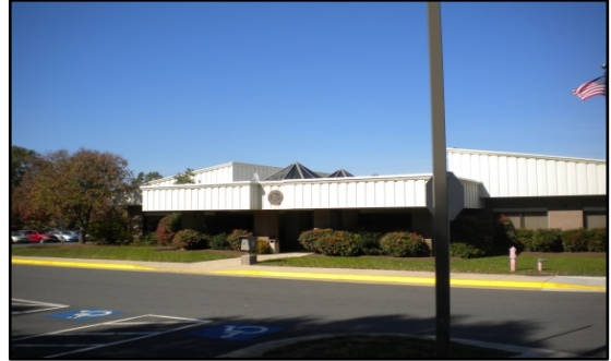
Public Works & Utilities Building A

Renovate the water/sewer shop in Building B and renovations/expansions to both Buildings A & B.