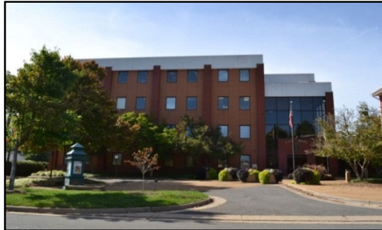
Marvin L. Gillum City Hall

City Hall Renovations/Improvements (G-016) Completed roof replacement.