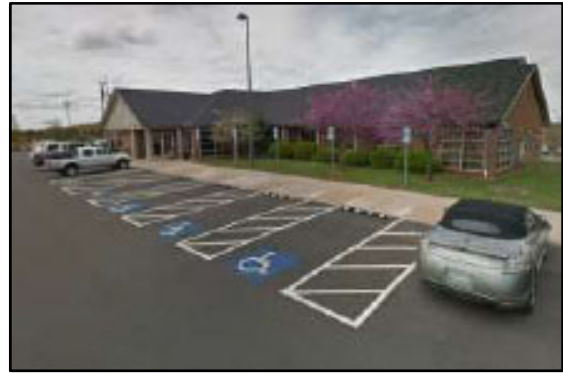
Manassas Customer Service Center